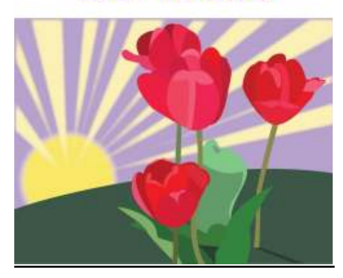
April 16 Sunrise Service 6:15 AM Children's Program 9 AM Traditional Service 10:30 AM