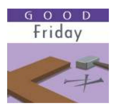
April 14 at 7 PM