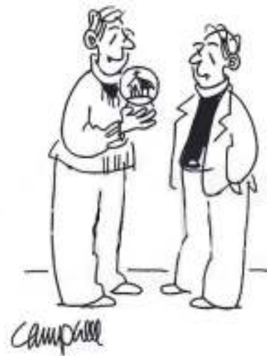
"See? The church is full now, but after you shake it and make it snow, the church is empty."